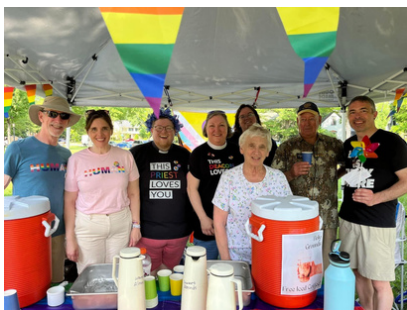
Pride in the Park 2023