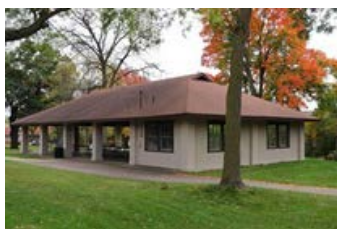
Odd Fellows Pavilion 1011 Forest Avenue

Join us for an evening of fun and fellowship at Odd Fellows Park on Wednesday, July 19. Bring your favorite dish to share! After eating, we will have an old-fashioned sing-along and finish the evening off with pie! The fun begins at 5:30!